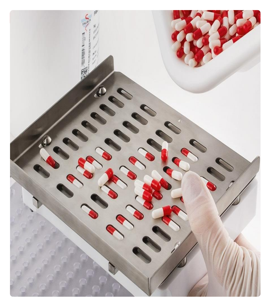
FagronLab® - capsule filling machine